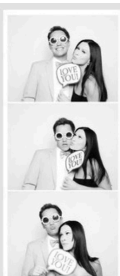
the Knowles SEPTEMBER 9, 2023