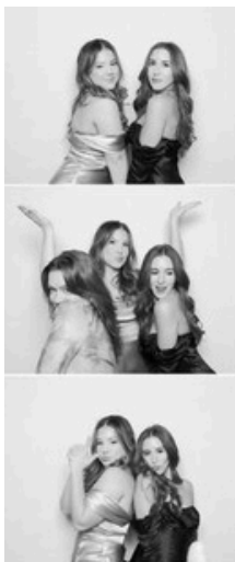
The Jacobes 10.8.23 ASHEVILLE, NC