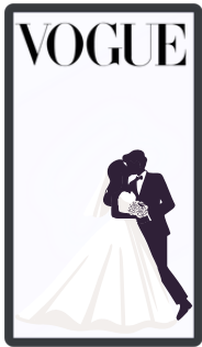
PHOTO BOOTH AND MAGAZINE BOX

A photobooth complete with a DSLR camera, lighting, backdrop options and custom photo prints. Also choose from a "Magazine Cover" step-in Box with customizable front to display any messaging you like