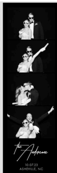
the Andersons 10.07.23 ASHEVILLE, NC