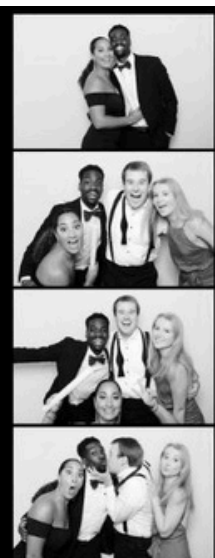
the Russells EST 9.9.2023 CLAYTON, GA